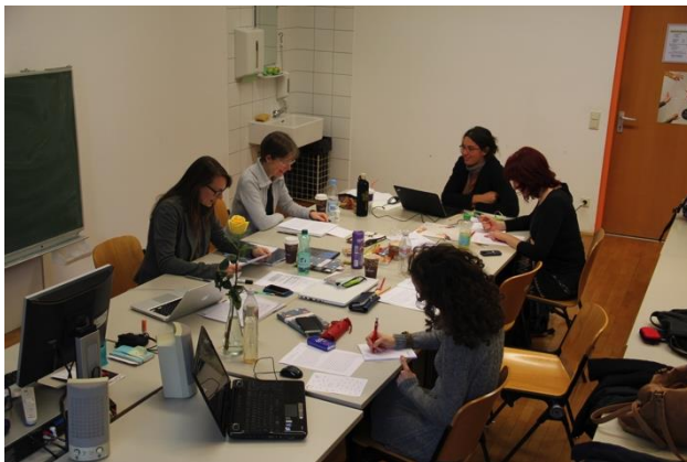
Workshop of the Slovenian-German Group in Graz, autumn of 2013

In the course of the project the working groups met three times for face-to-face workshops and outside of these meetings they conducted online sessions in order to discuss their translations. The goal of these workshops was to train future cultural mediators in literary translation and to work on translations in a group setting. In addition to the working sessions in language pairs, tandem workshops with complementary language pairs working on texts were also conducted. Outside of the workshops participants worked on texts independently, yet with the support of the mentor and other members of the group.