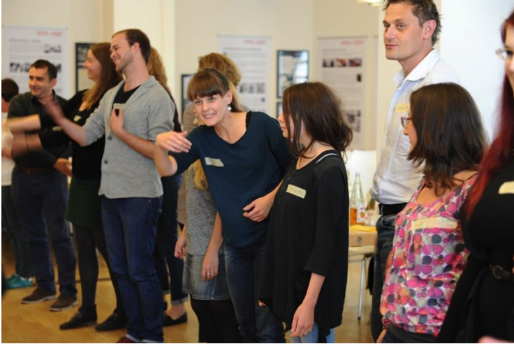
Workshop on presentation and moderation in Stuttgart, 2014